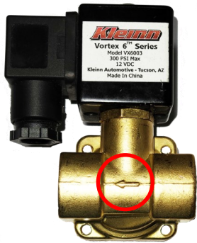
Arrow cast in housing points toward horn

Replace the cover over the wiring block. Be sure the cover is properly seated in the rubber base before tightening the screw. The cover can be placed over the wiring block facing in any direction.